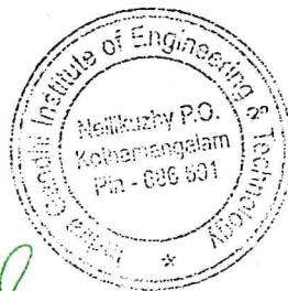
PRINCIPAL Indira Gandhi Institute of Engineering & Technology Nellikuzhy P.O., Kothamangalam-686 691